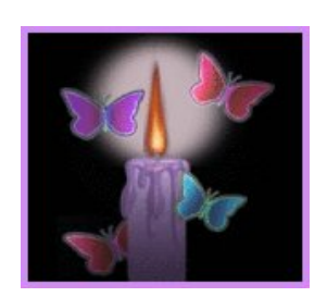
"I Invoke the Light of the Spirit here within. I am a Clear and Perfect Channel. I am Love, I am Light."

I need to mention that I am always growing with my abilities. I still need exceptional growth in understanding certain areas of this field. I am not an expert, but in this field it's hard for anyone to say they are an expert. However, I offer you my years of practice and experience in this field, as well as my faith that this is how I believe it to be. You can really only go by your own experiences, length of time in the field and references of readings done on others. This is information that will help guide you on your path and I want you to know that you will progress and evolve in your own way. :)